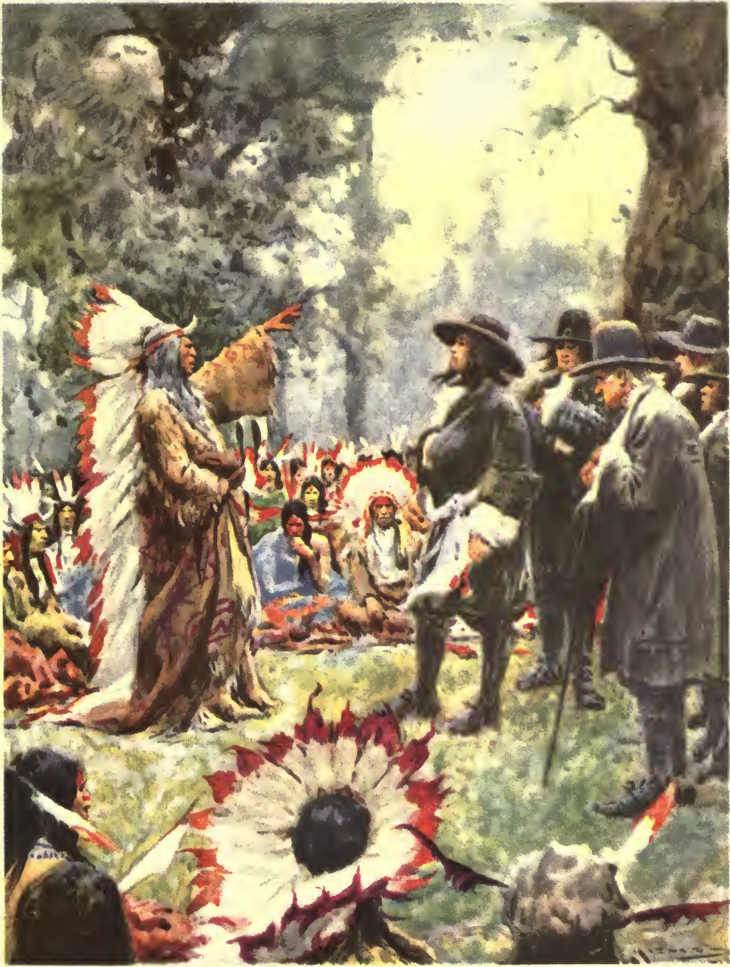
WILLIAM PENN'S TREATY WITH THE INDIANS

And there under the spreading branches of the great elm tree they swore to live in peace and brotherly love.